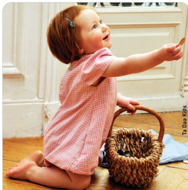
Ta Daa Kids