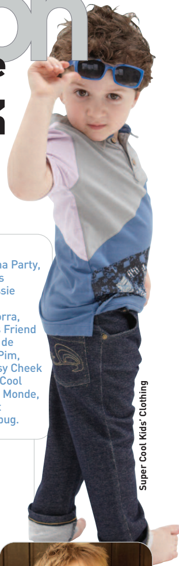
Super Cool Kids' Clothing