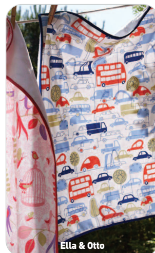
Ella & Otto