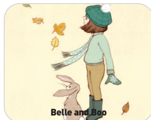
Belle and Boo