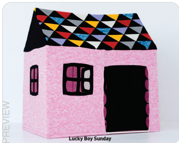
Lucky Boy Sunday

Interiors are available from Dandy Star, Lunn Antiques, Global Affairs and Nest Lifestyle.