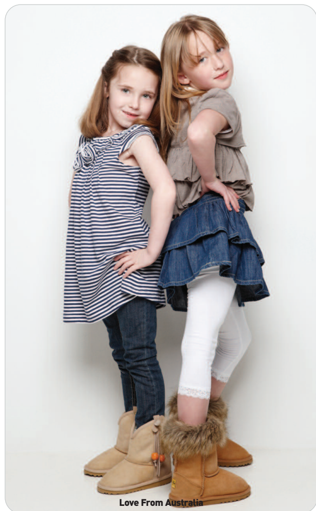
Love From Australia