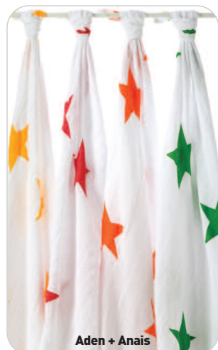
Aden + Anais