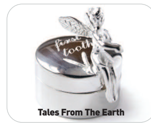
Tales From The Earth