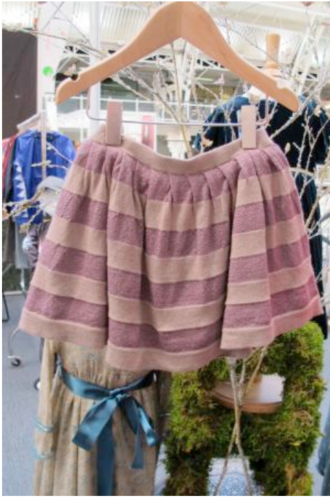
I Love Gorgeous at Bubble autumn/winter 2011/12