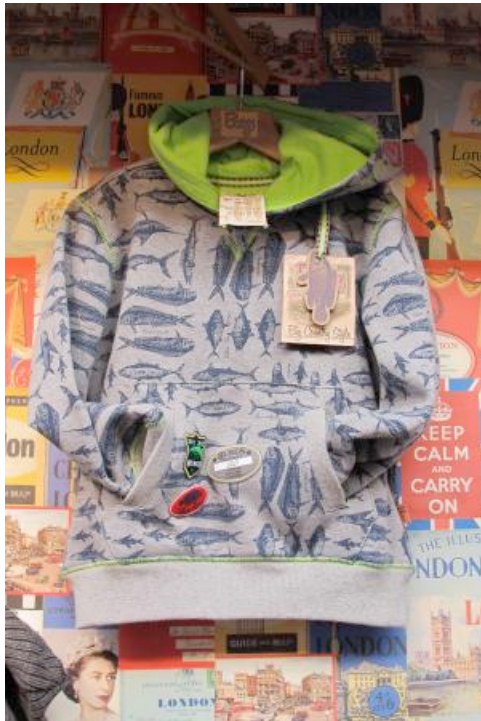
Burqs at Bubble autumn/winter 2011/12