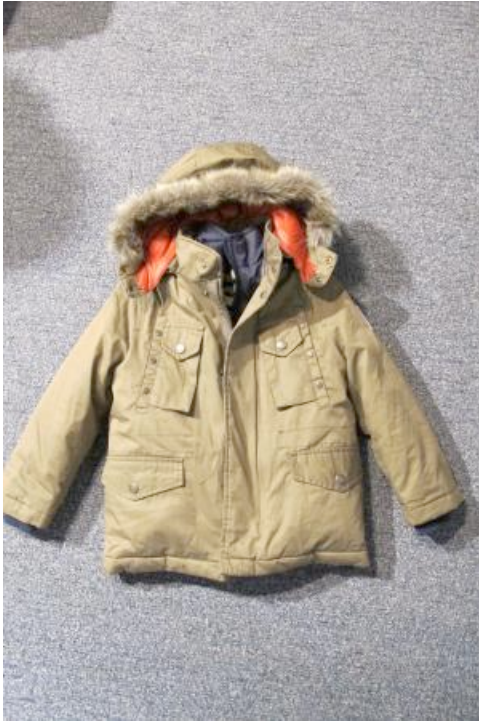
IKKS at Bubble autumn/winter 2011/12