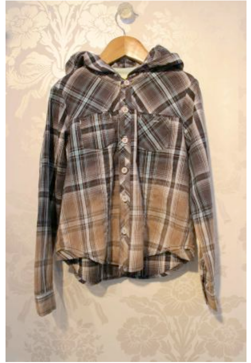
Fluke at Bubble autumn/winter 2011/12