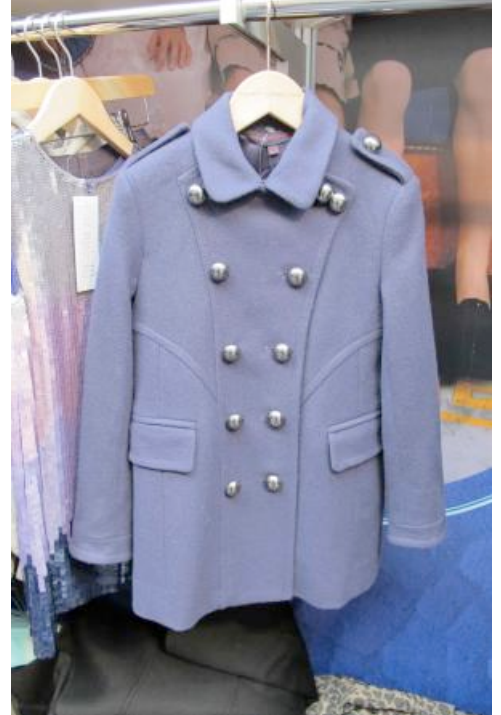
French Connection Kidswear at Bubble autumn/winter 2011/12