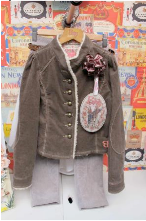
Burgs at Bubble autumn/winter 2011/12