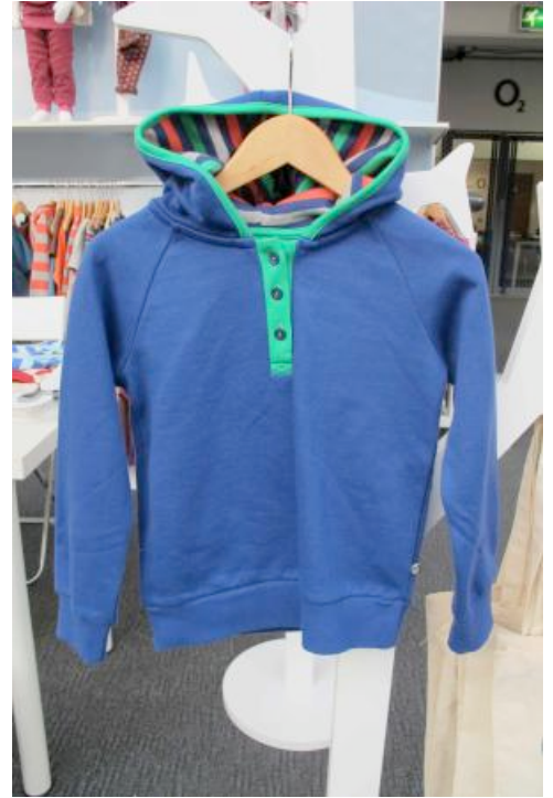
Green Baby at Bubble autumn/winter 2011/12