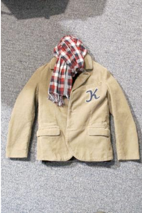
IKKS at Bubble autumn/winter 2011/12