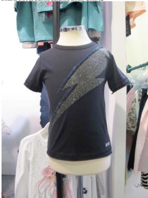
Dolls & Dirt at Bubble autumn/winter 2011/12