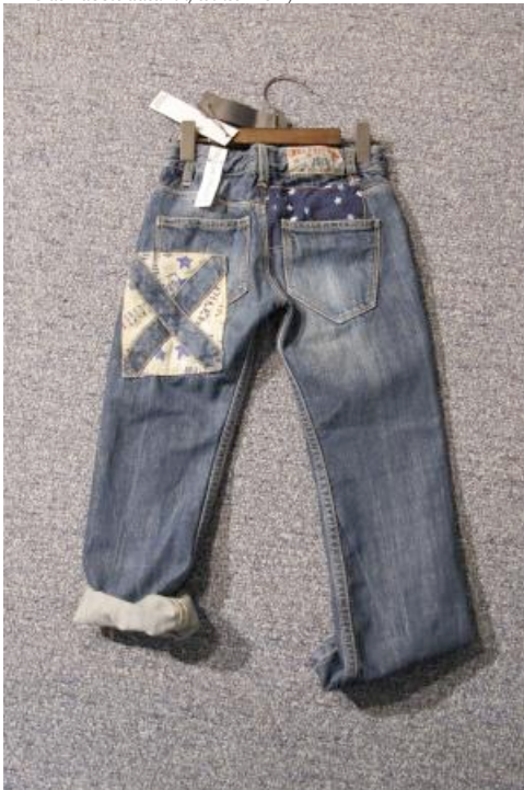
IKKS at Bubble autumn/winter 2011/12