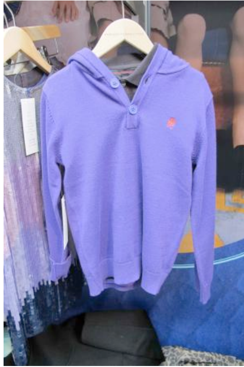
French Connection Kidswear at Bubble autumn/winter 2011/12