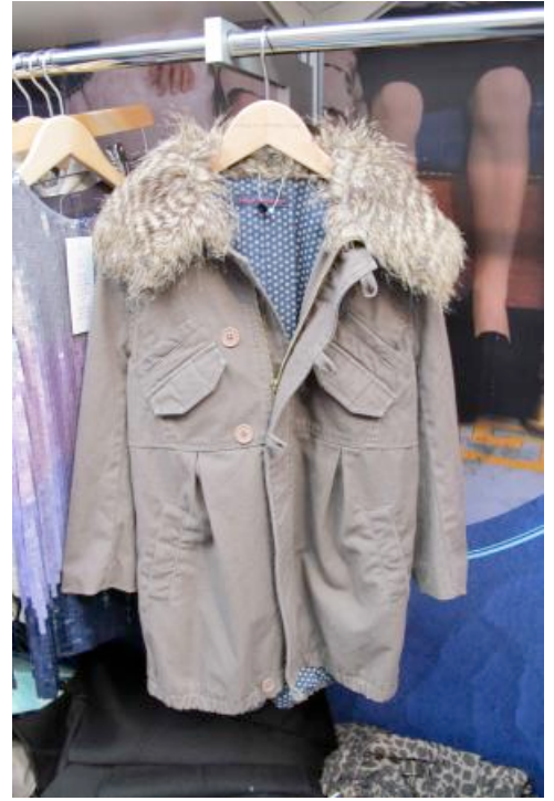
French Connection Kidswear at Bubble autumn/winter 2011/12