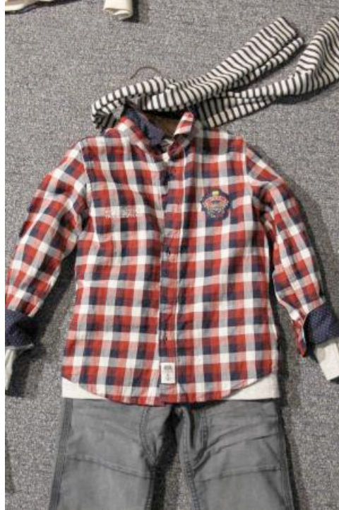
IKKS at Bubble autumn/winter 2011/12