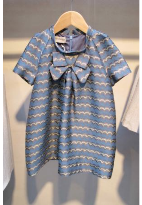
Hucklebones at Bubble autumn/winter 2011/12