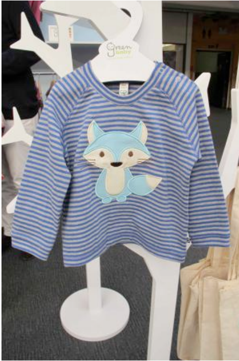
Green Baby at Bubble autumn/winter 2011/12