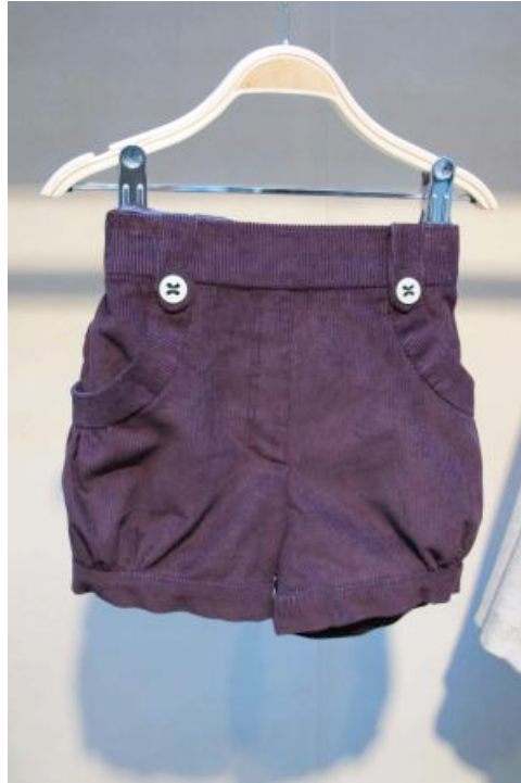
Hucklebones at Bubble autumn/winter 2011/12