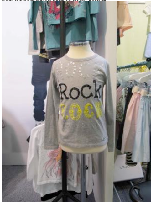
Dolls & Dirt at Bubble autumn/winter 2011/12