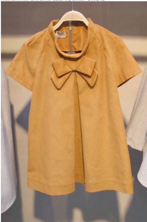
Hucklebones at Bubble autumn/winter 2011/12