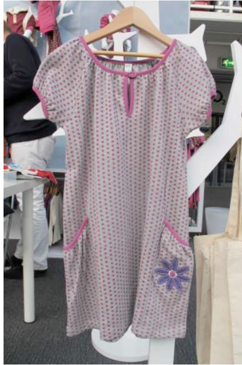
Green Baby at Bubble autumn/winter 2011/12