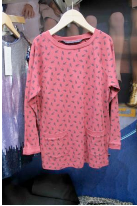
French Connection Kidswear at Bubble autumn/winter 2011/12