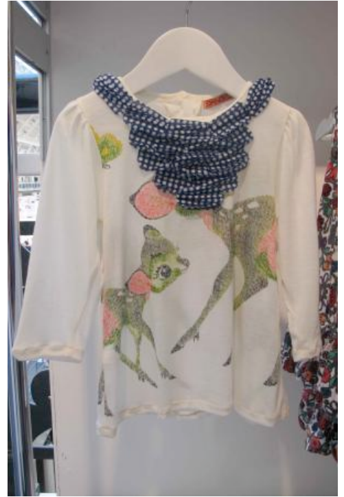
Dandy Doo at Bubble autumn/winter 2011/12