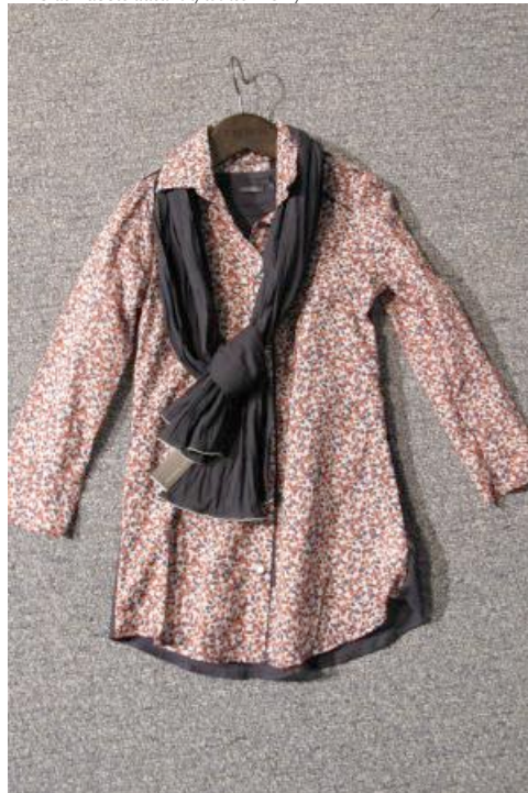
IKKS at Bubble autumn/winter 2011/12