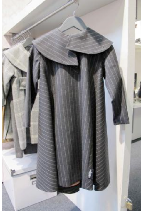
K For Keeps at Bubble autumn/winter 2011/12