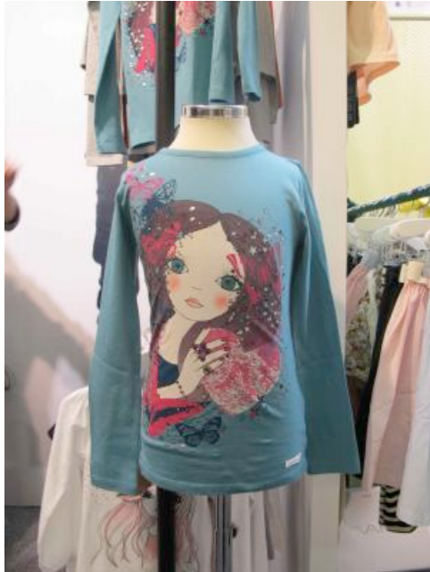
Dolls & Dirt at Bubble autumn/winter 2011/12