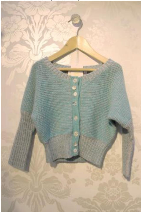
Fluke at Bubble autumn/winter 2011/12