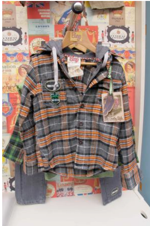
Burqs at Bubble autumn/winter 2011/12