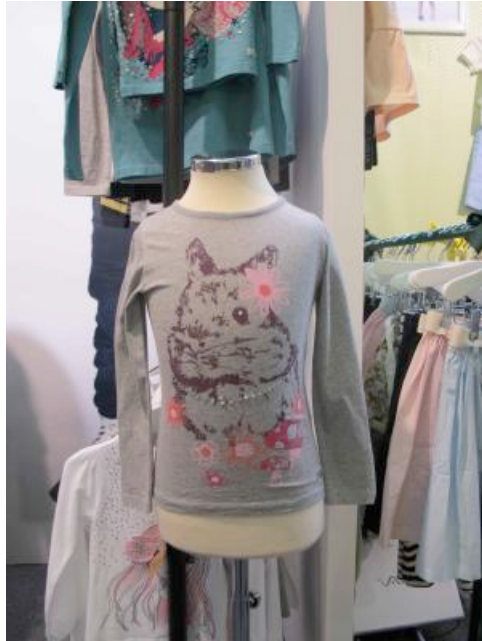
Dolls & Dirt at Bubble autumn/winter 2011/12