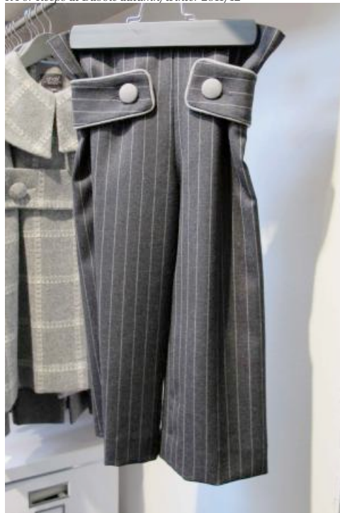
K For Keeps at Bubble autumn/winter 2011/12