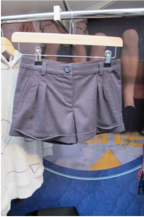
French Connection Kidswear at Bubble autumn/winter 2011/12