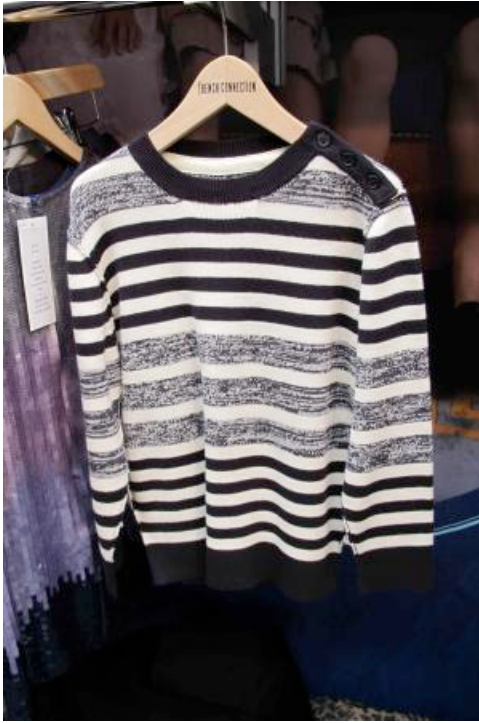
French Connection Kidswear at Bubble autumn/winter 2011/12