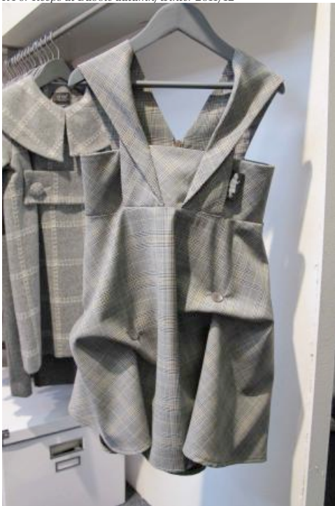
K For Keeps at Bubble autumn/winter 2011/12