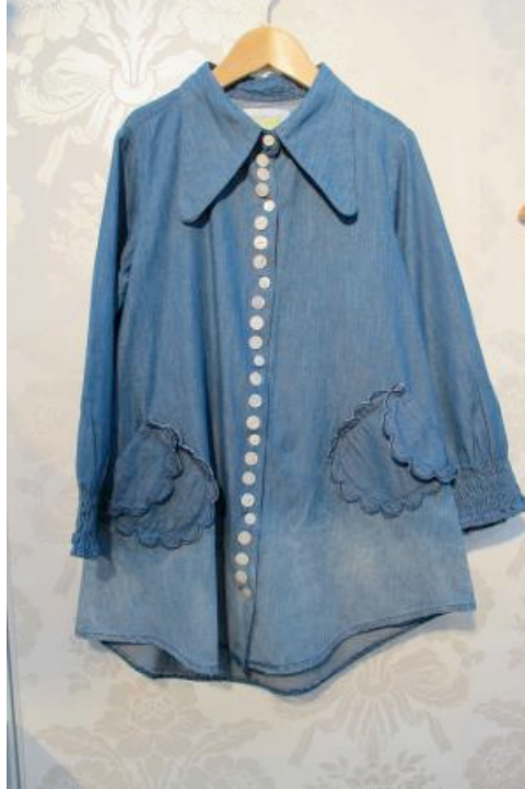
Fluke at Bubble autumn/winter 2011/12