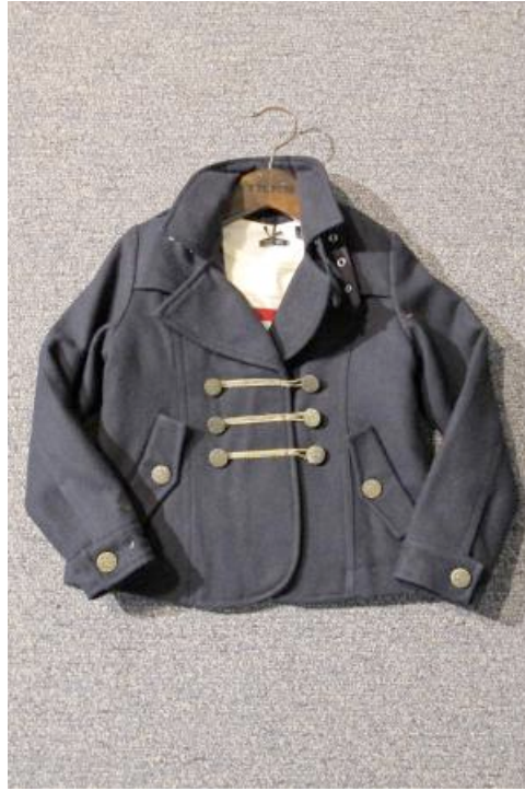
IKKS at Bubble autumn/winter 2011/12