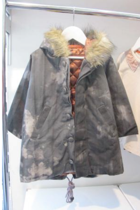
Dandy Doo at Bubble autumn/winter 2011/12