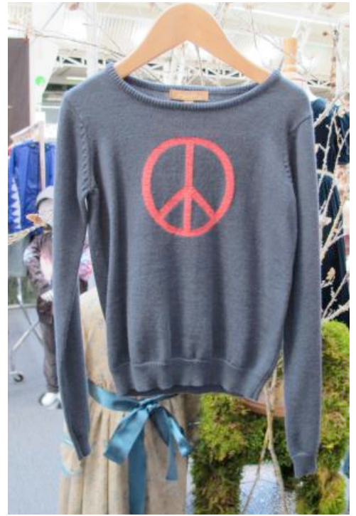
I Love Gorgeous at Bubble autumn/winter 2011/12