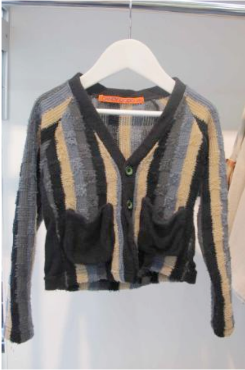
Dandy Doo at Bubble autumn/winter 2011/12