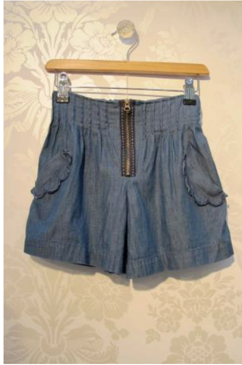
Fluke at Bubble autumn/winter 2011/12