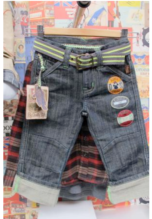
Burqs at Bubble autumn/winter 2011/12