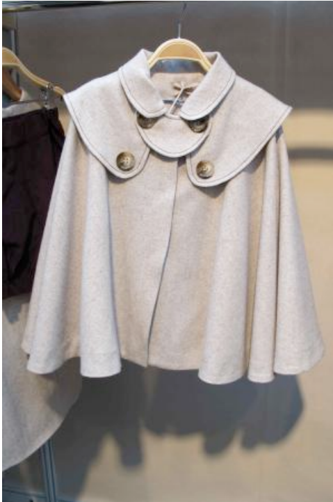
Hucklebones at Bubble autumn/winter 2011/12