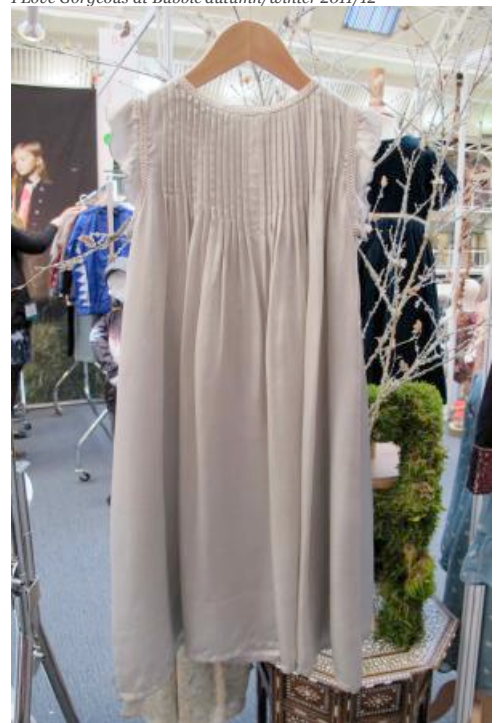
I Love Gorgeous at Bubble autumn/winter 2011/12