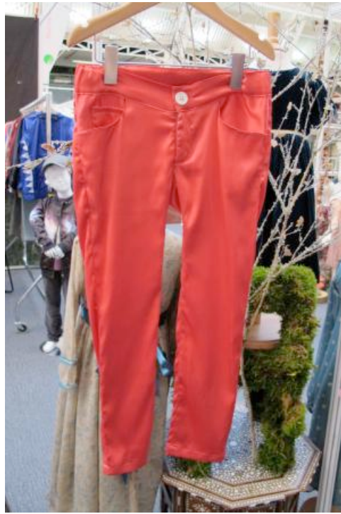
I Love Gorgeous at Bubble autumn/winter 2011/12