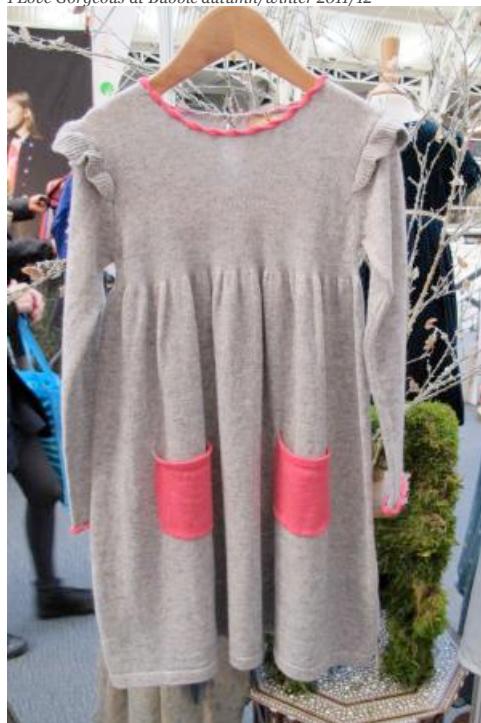
I Love Gorgeous at Bubble autumn/winter 2011/12