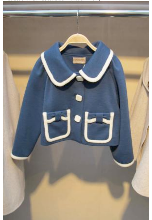
Hucklebones at Bubble autumn/winter 2011/12