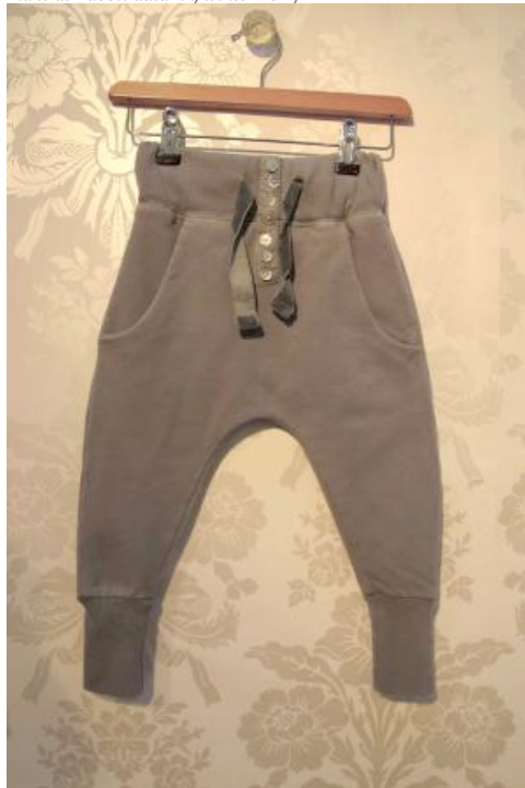
Fluke at Bubble autumn/winter 2011/12