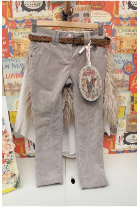
Burgs at Bubble autumn/winter 2011/12