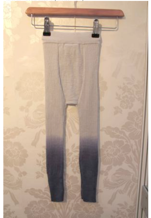
Fluke at Bubble autumn/winter 2011/12