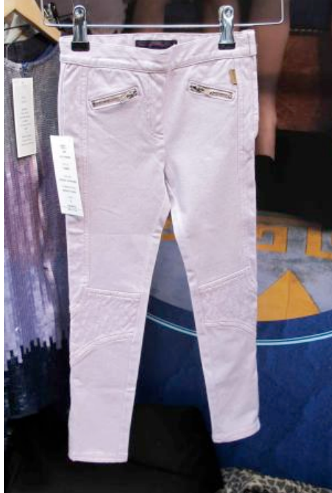
French Connection Kidswear at Bubble autumn/winter 2011/12