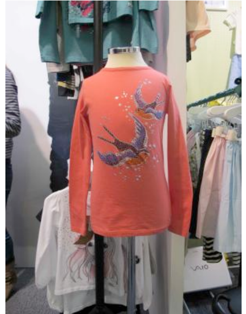
Dolls & Dirt at Bubble autumn/winter 2011/12