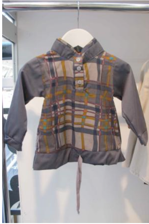
Dandy Doo at Bubble autumn/winter 2011/12