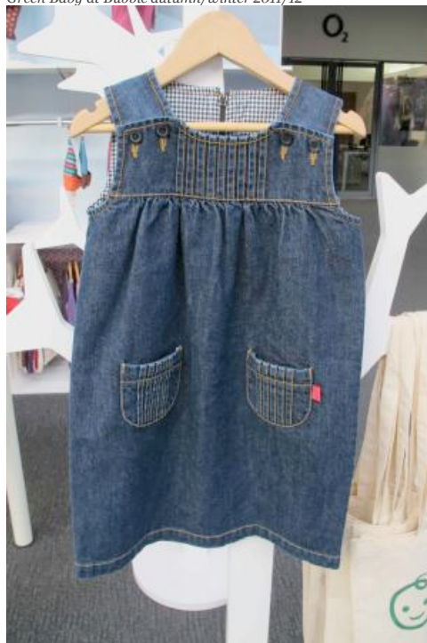
Green Baby at Bubble autumn/winter 2011/12