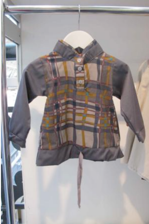
Dandy Doo at Bubble autumn/winter 2011/12