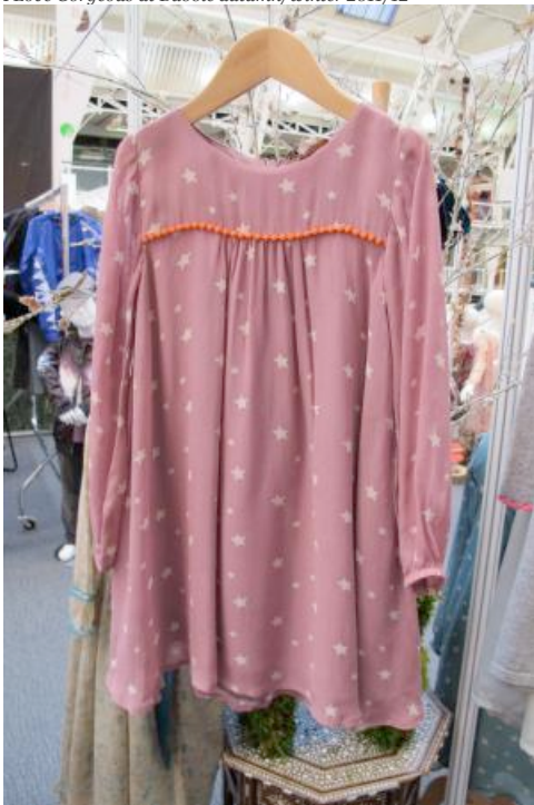
I Love Gorgeous at Bubble autumn/winter 2011/12