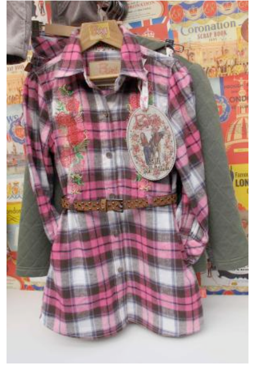
Burgs at Bubble autumn/winter 2011/12