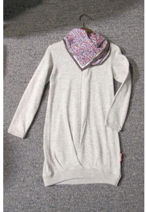
IKKS at Bubble autumn/winter 2011/12