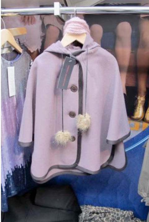
French Connection Kidswear at Bubble autumn/winter 2011/12