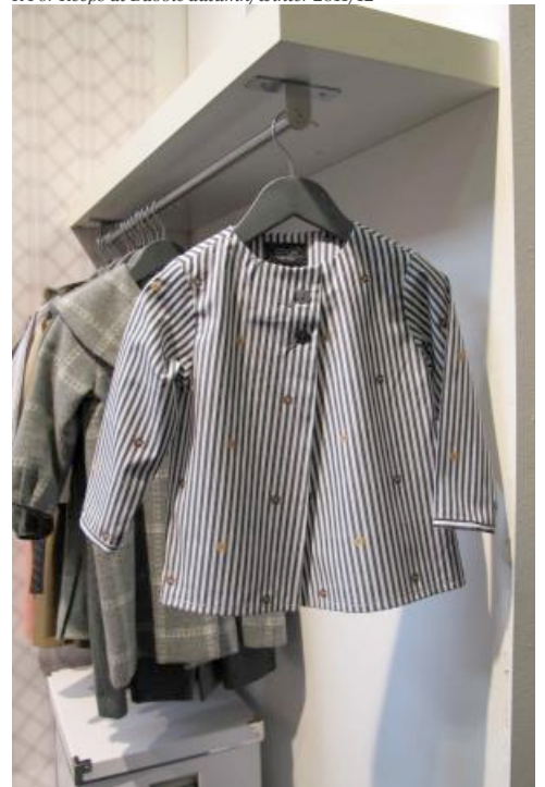
K For Keeps at Bubble autumn/winter 2011/12