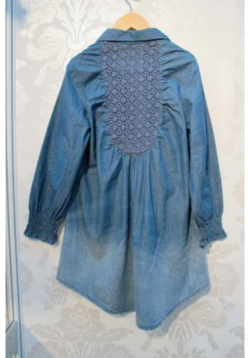
Fluke at Bubble autumn/winter 2011/12