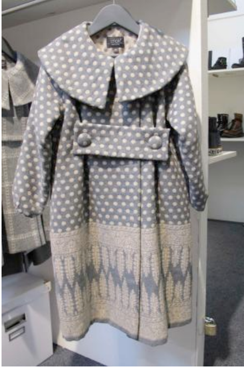
K For Keeps at Bubble autumn/winter 2011/12