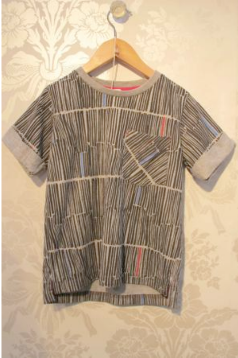
Fluke at Bubble autumn/winter 2011/12