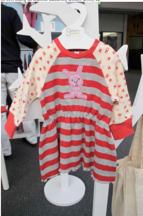
Green Baby at Bubble autumn/winter 2011/12