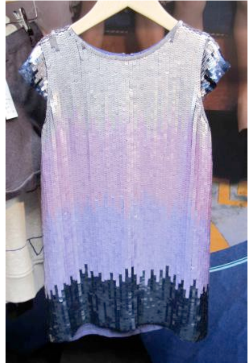
French Connection Kidswear at Bubble autumn/winter 2011/12