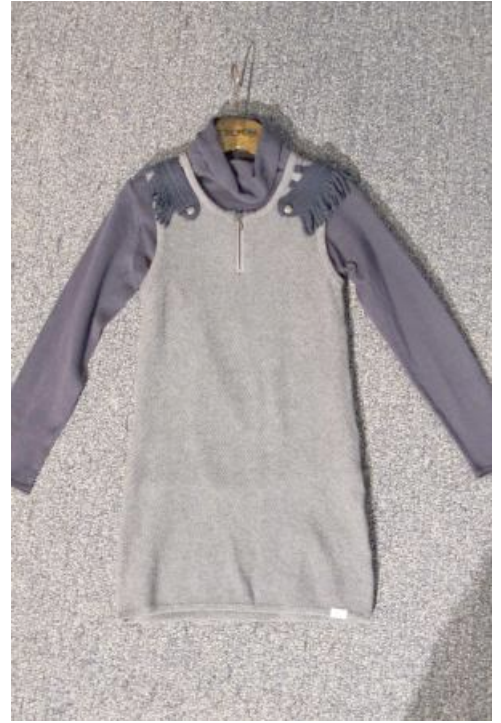
IKKS at Bubble autumn/winter 2011/12