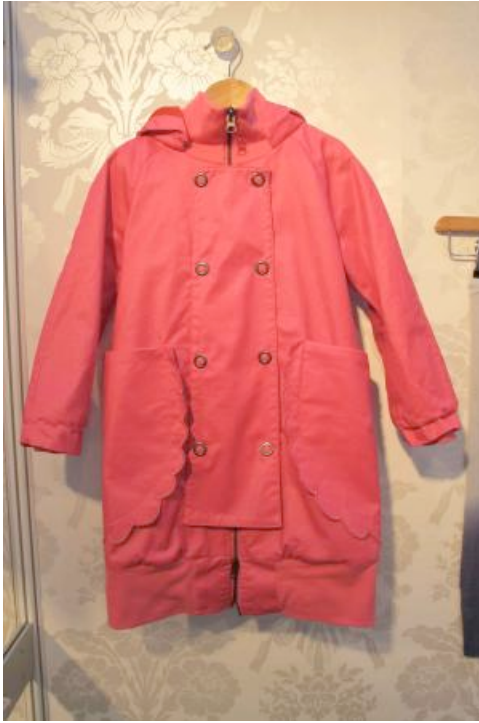
Fluke at Bubble autumn/winter 2011/12