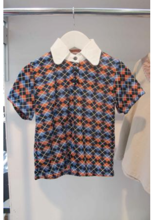
Dandy Doo at Bubble autumn/winter 2011/12