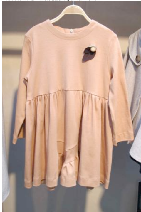
Hucklebones at Bubble autumn/winter 2011/12