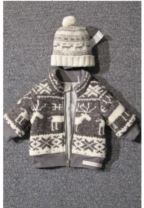
IKKS at Bubble autumn/winter 2011/12