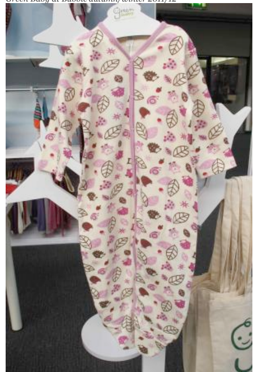
Green Baby at Bubble autumn/winter 2011/12