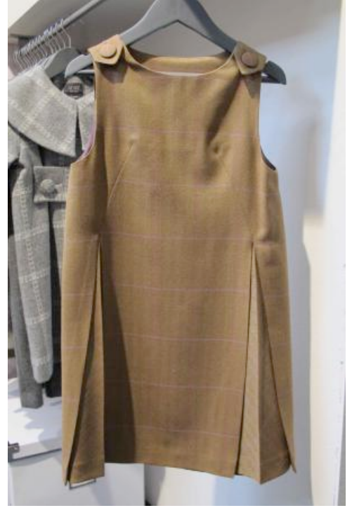
K For Keeps at Bubble autumn/winter 2011/12