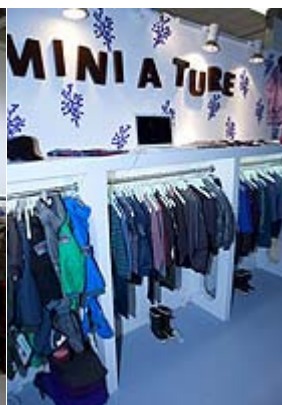
Mini A Ture