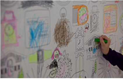
Tick Tock wallpaper frieze, Mini Moderns