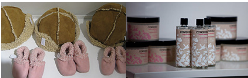
Babies in Sheeps Clothing

The company is continuing to work on the organisation through to the end of 2009. Next season, Bubble London will show at a new venue, at the Business Design Centre in the heart of Islington.