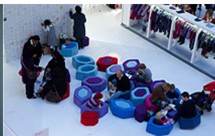
Bubble London chill area

The first edition of January 2008 hosted 70 niche brands, which has now nearly doubled to 130, covering fashion, lifestyle products, organic ranges, footwear and accessories.